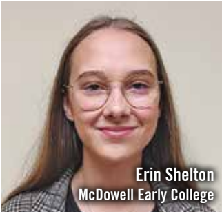
Erin Shelton McDowell Early College